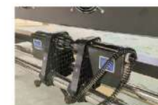
External power supply, intelligent rolling system