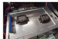
Automatic moisturizing cleaning assembly ensures the stability of head cleaning and improves working stability.