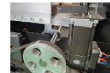
High quality DC servo motor with good stability and long life.