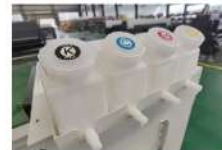
Stable Bulk System Ensures Amazing Printing Speed