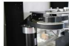
High-precision and high-stability tensioning pulley system.