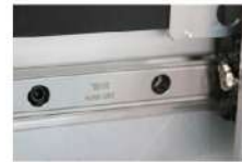
THK high-precision mute rail.