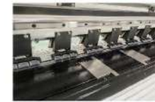
New pinch roller structure of three in group brings more stable feeding precision.