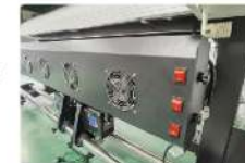
Infrared heater and cooling fan.